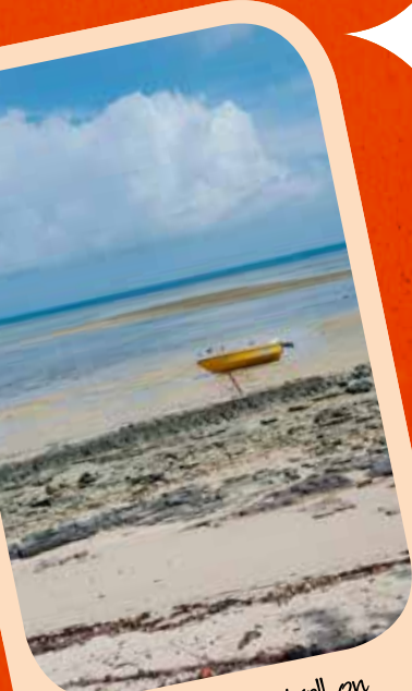
A lunchtime stroll on Coconut Island