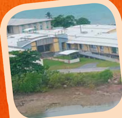
Thursday Island Hospital from above

My trip to Moa Island (Poruma) was via helicopter which in itself was a new experience that allowed me to gain a bird's eye view of the gorgeous contrasting aquamarines of the Torres Strait waterway and the marine life that dwells beneath.