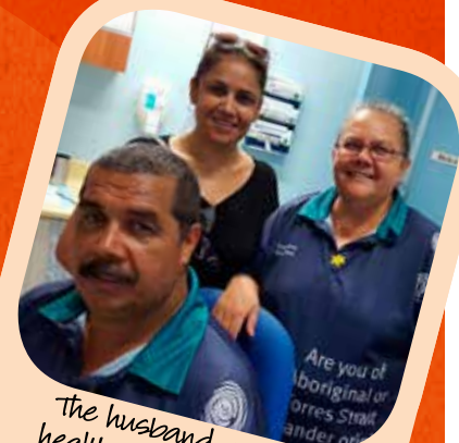
The husband and wife health worker team at St Pauls on Moa Island